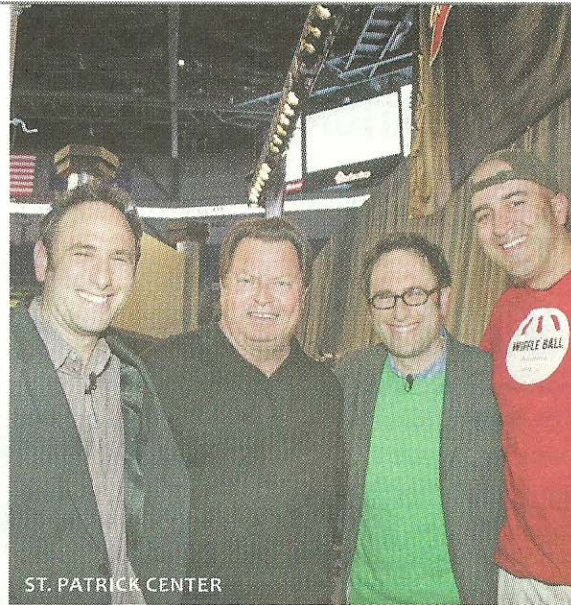
ST. PATRICK CENTER

636.200.4724 | 129 Woods Mill Road | manchesterumc.org